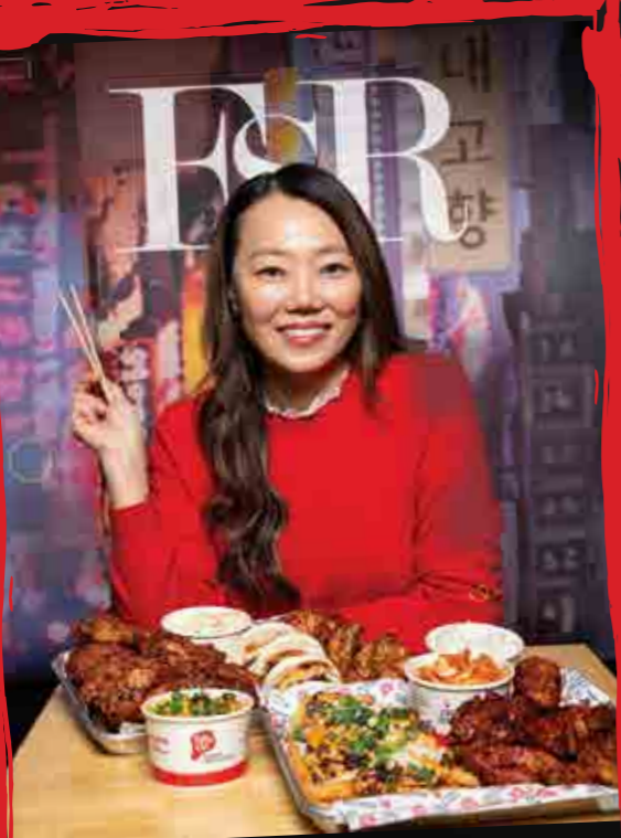
- FSR Magazine 2026