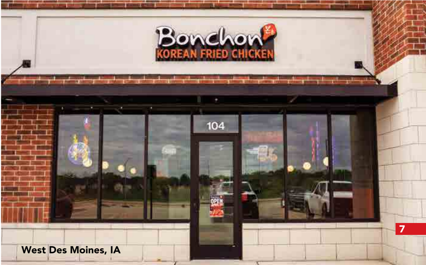
West Des Moines, IA