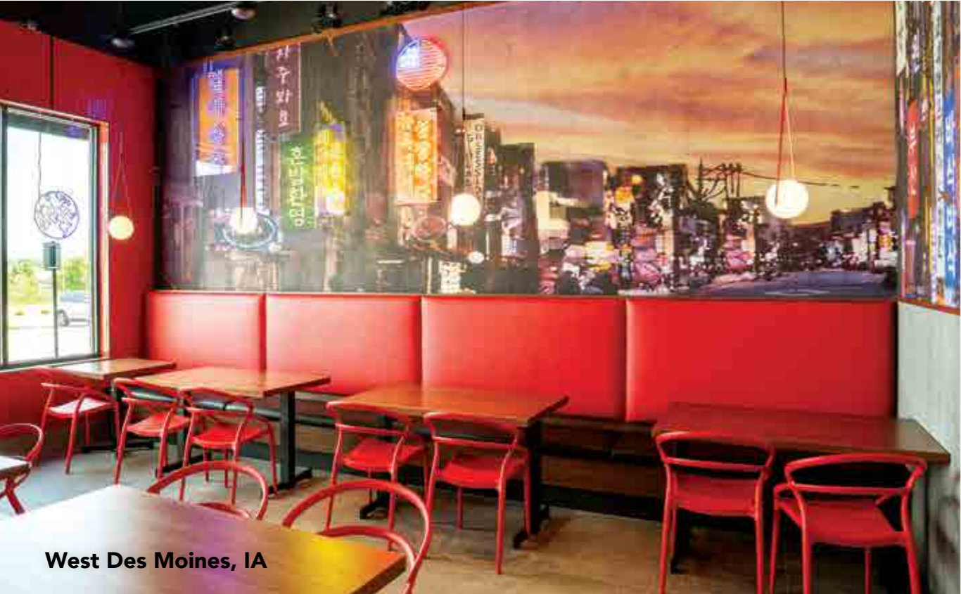
West Des Moines, IA